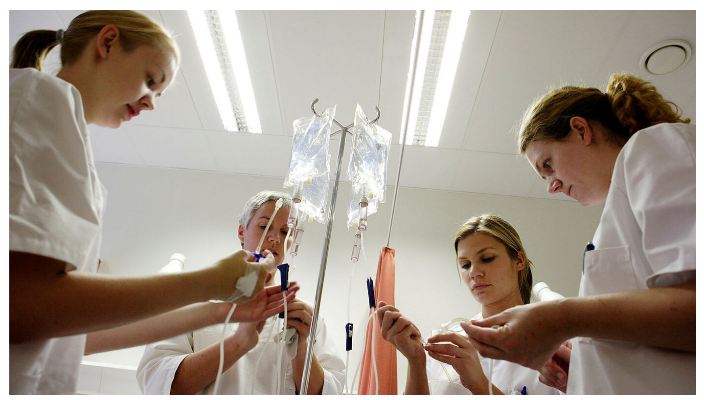
MULTIFACETED ROLE: The nurse teacher must support the students during the learning process, help the supervisors... READ MORE ✓

The authors declare no conflicts of interest.